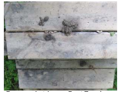
Raccoon Latrine on Bent Tree Lane after several days of rain